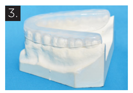
PMT and Composite Splint.