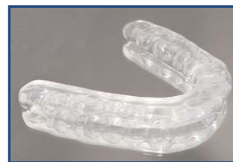
Flat Plane Splints

We Continue to Update Our Website to Serve You Better